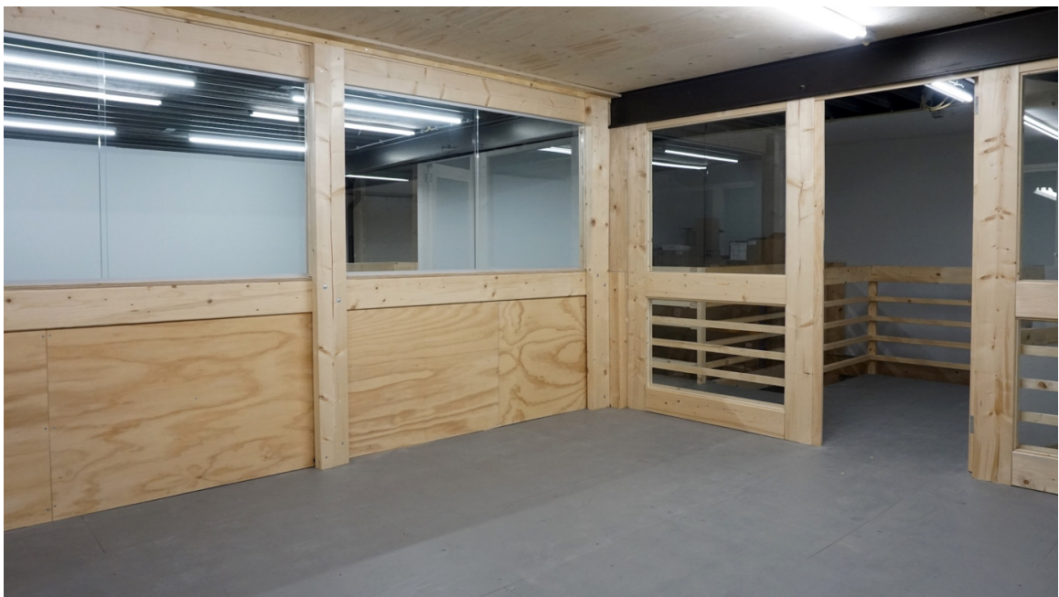
view from furthest corner in docu space