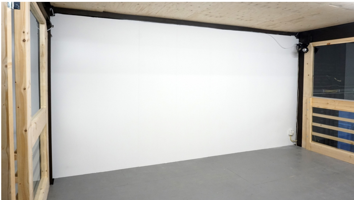
The back-wall, entrance door on the left side, + remember the black spotlight