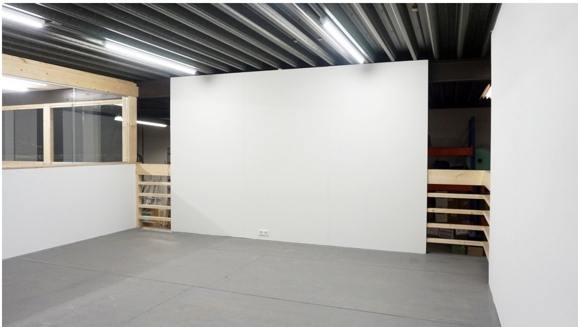
Between the standing walls are 'viewpoints' to the warehouse