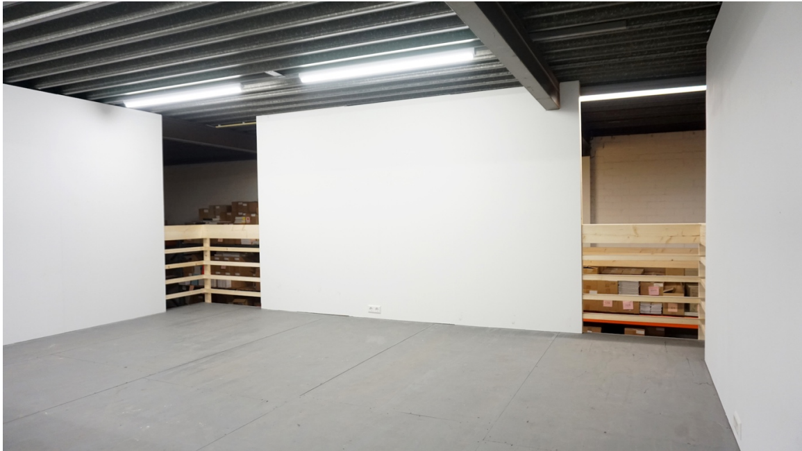
Here you see the three walls from the entrance point of view