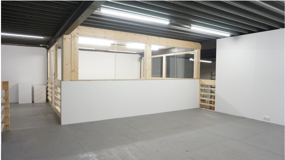
A view from the side to the 'docu space'