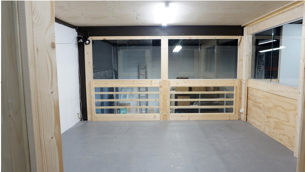
View from entrance of the docu space. Photographer in previous image stood underneath the black spotlight in the top left corner